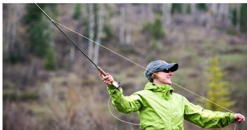
Many smaller trout streams at higher elevation can be found in the headwaters of the Thompson Divide.

Conservation is a long game. That proved true on the Mettawee River in rural Vermont where TU dedicated nearly a decade to removing dams that have been blocking fish passage for over 50 years. Reconnecting this rich fish habitat was a priority but knitting together funding and support for six projects in six years proved tricky. With all the dams located on private property, TU developed relationships with landowners and gained their support—and trust—to remove each barrier. After removing the barriers, TU's team on the ground continued their efforts to nurture the river, bolstered by the support of private funders and local members. They restored miles of streambank on both the northern and southern sections of the Green Mountain National Forest. Today, the Mettawee River runs free from its tiny Green Mountain headwaters to Lake Champlain.