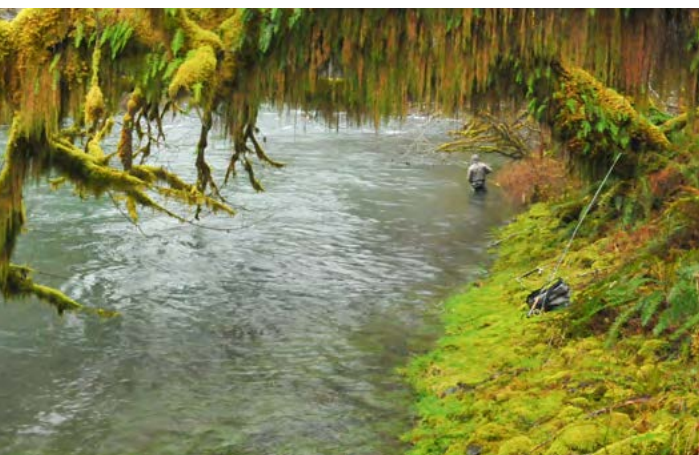
For anglers and coastal Tribes, OP restoration projects are critical to rebuilding wild steelhead and salmon runs.

On the Olympic Peninsula, more than 4,000 culvert barriers block salmon and steelhead passage to critical spawning habitat. TU and the National Oceanic Atmospheric Administration (NOAA) partnered to replace eight major barriers as a part of the Coldwater Connection Campaign to reconnect 125 miles of high-quality salmon and steelhead streams on Washington's coast. The project opened over seven miles of habitat for spawning and rearing and increased capacity for the Hoh Tribal community to work on salmon restoration. The effort will improve spawning and rearing habitat for commercially and recreationally important salmon species. Project partners include the Wild Salmon Center, the Coast Salmon Partnership, the Quileute Tribe, the Quinault Indian Nation, the Hoh Tribe, and others. LEARN MORE