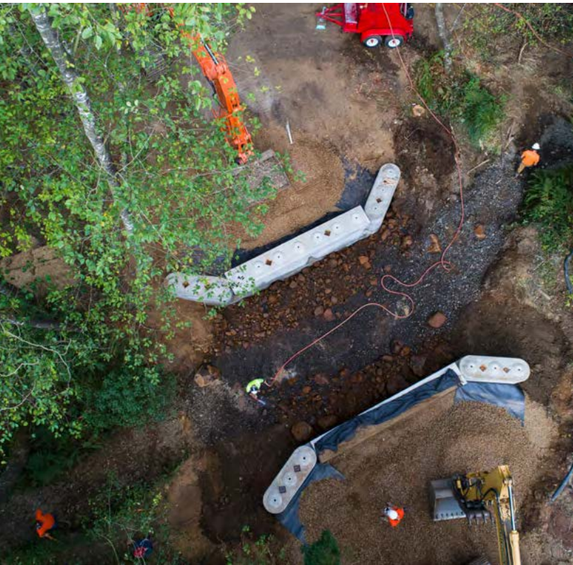
SSH worked with landowners to replace two barrier culverts with a bridge to open fish passage and restore the stream channel in Tomlinson Creek, a tributary of the Tillamook River and Tillamook Bay.