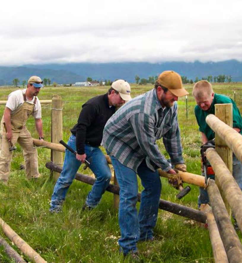
Volunteers from Montana's Big Blackfoot Chapter help build a fence on Kleinschmidt Flat, supporting a grazing management system along the North Fork Blackfoot River.