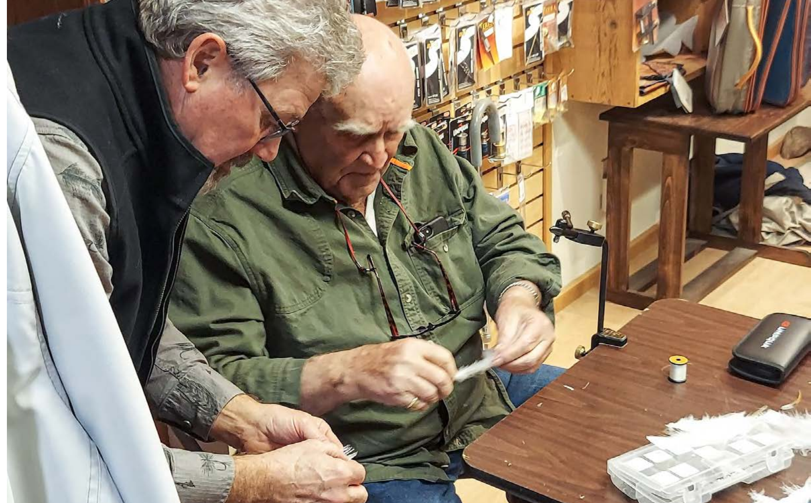
GBTU fly tying event.