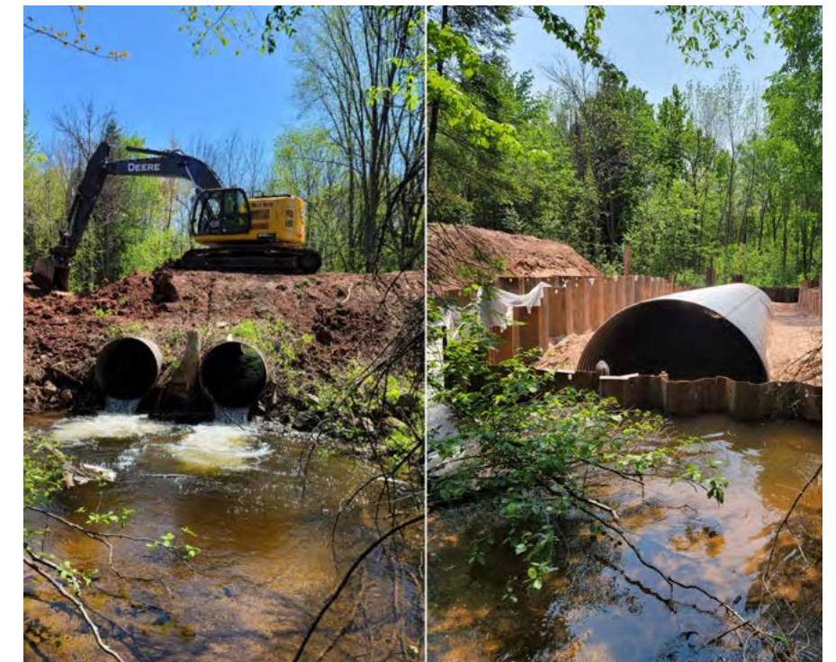
Trout Creek culvert (shown before and after) is also stabilizing the streambank downstream where high velocity created a plunge pool.