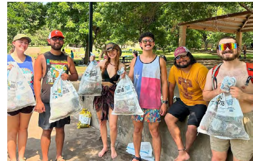
Members of the TU Costa 5 Rivers Texas State Fly Fishing Club joined forces with GRTU to clean up the San Marcos River after Memorial Day weekend.

Everything is bigger in Texas – including the Guadalupe River TU chapter (GRTU) at 5,400 members strong. The chapter uses this power in numbers to launch and sustain several coldwater conservation initiatives, from funding grants through our Coldwater Conservation Grant Program and the GRTU Foundation, to conducting and sponsoring local river clean ups. GRTU puts special emphasis on building the next generation of conservation-minded anglers with support of Trout in the Classroom, Youth Trout Camp, TU Teen Summit, and the GRTU Tomorrow Fund. True to keeping things Texas-sized, GRTU's member engagement and fundraising event, Troutfest TX, has grown to become one of the largest and most respected conservation and fly fishing events in the country, funding almost a half million dollars of grants in the past seven years. Guadalupe River Chapter of Texas Trout Unlimited