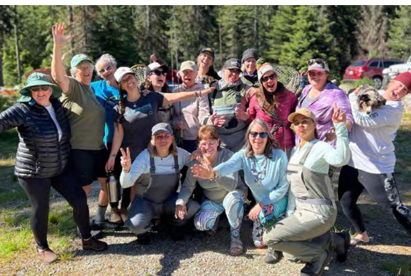
Spokane Women on the Fly at their Annual Summer Suds Camping Trip.

All up, TU chapter volunteers gifted more than 630,000 hours to their rivers and streams, hosted nearly 5,000 community engagement events, and connected over 86,000+ kids with nature.