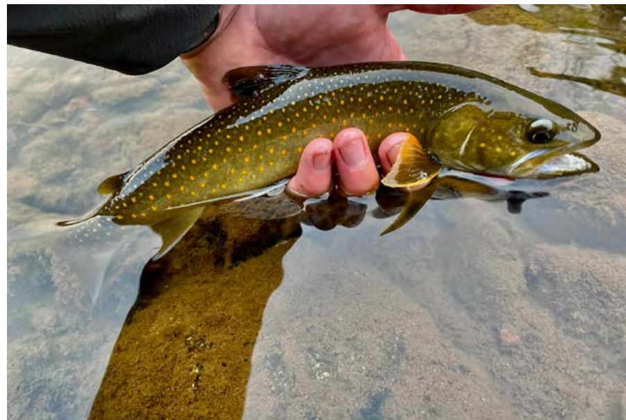
Bull trout, listed as "threatened" under the Endangered Species Act (ESA), have been largely eliminated from significant portions of their historic range.