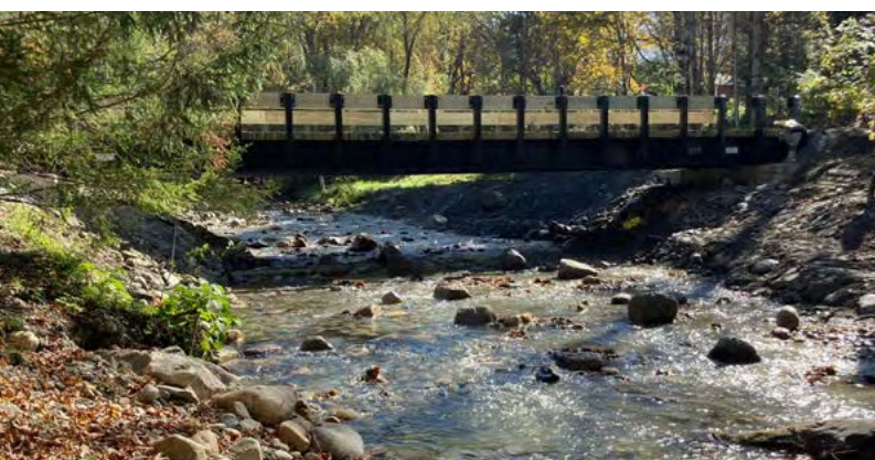
A bridge replacement on the Mettawee River that flows unimpeded.

TU is committed to solving hard problems that often require years of unwavering resilience and collaboration before we can cross the finish line. Your ongoing support is a sustaining force behind our success, enabling us to overcome roadblocks, mobilize communities, and work tirelessly to get the work done. Below are two examples of hard-earned conservation wins that benefit fish, people, and communities. Read about more wins in the press release section of TU's Media Resources .