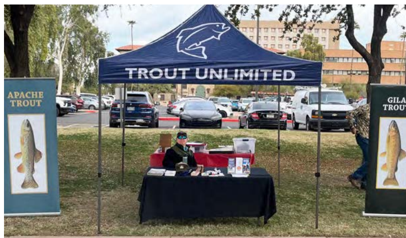
The Zane Grey Chapter in action at the Arizona State Capitol in Phoenix, advocating for wild and native trout.