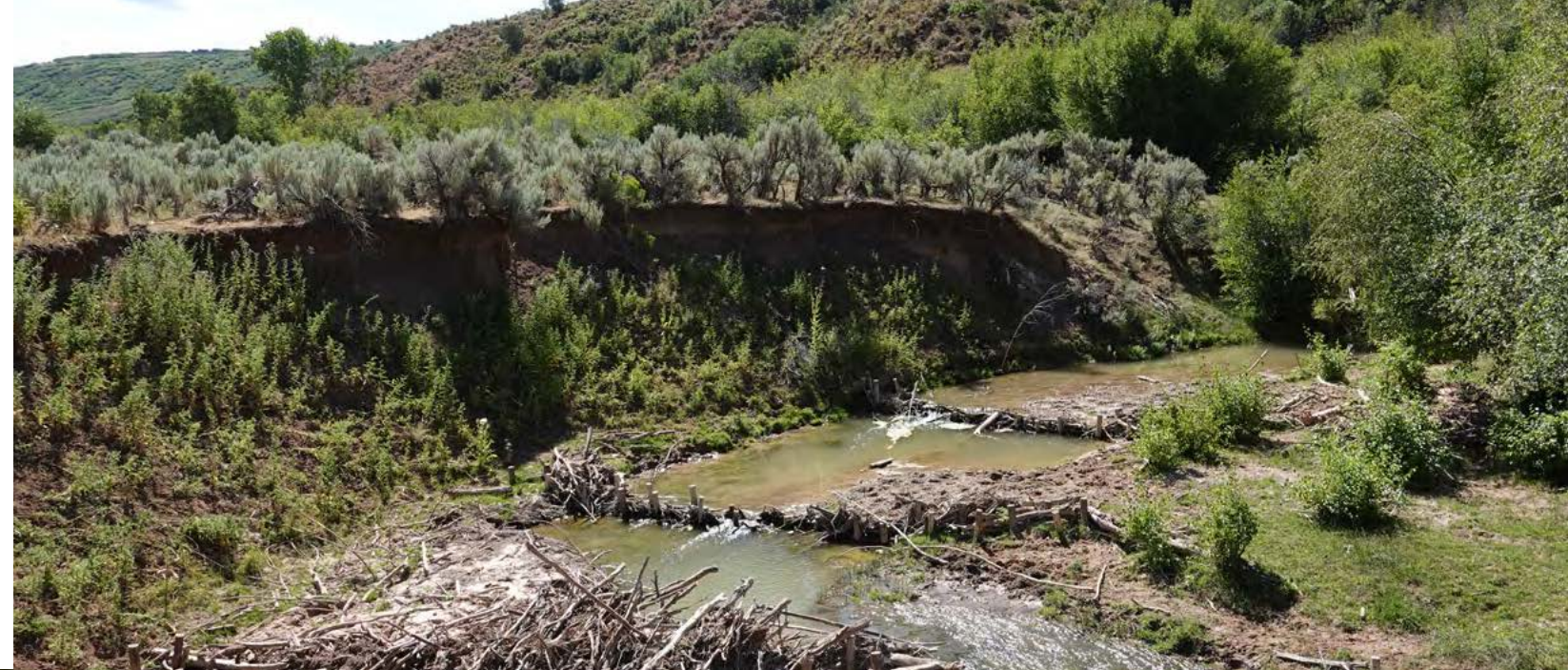
Beaver dam analog along the Weber River in Utah.